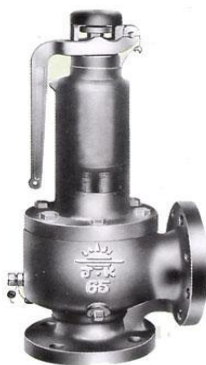
Mode : [JSV-HF11] Safety Valve with High Lift Type